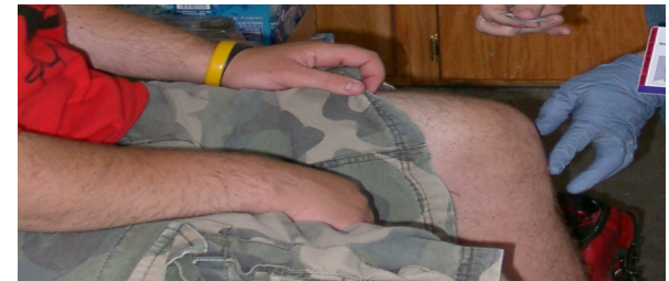
Nebraska Western Iowa MRC volunteers provided first aid support during the 2006 College World Series.

* The Salt Lake Valley Medical Reserve is looking to recruit, train and have on-call 12,000 volunteers who will respond promptly and efficiently to times of enhanced health and medical need.