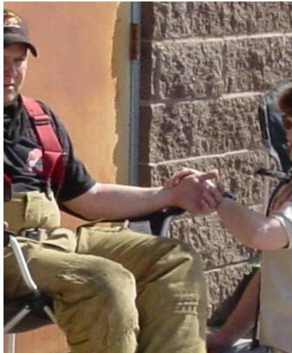
Natrona County (WY) MRC volunteers shown checking vital signs of firefighters from the Casper Fire Department.