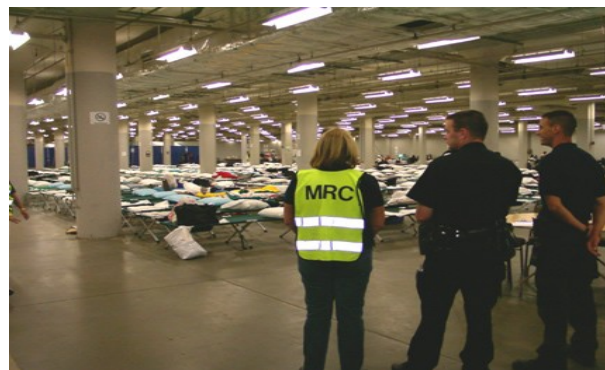
2005 Hurricane Evacuee Shelter , Midlands, NE

* United States citizenship is not required to be part of the MRC. Non-citizen, legal U.S. residents also are welcome to volunteer and contribute their time, knowledge, and skills to protecting and improving their communities.